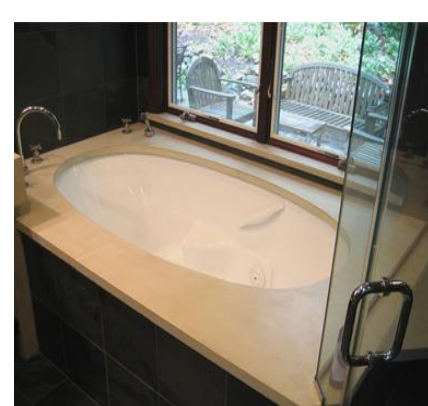
Tubs & showers