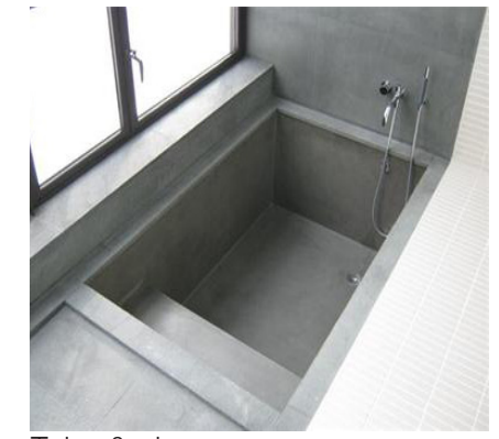
Tubs & showers