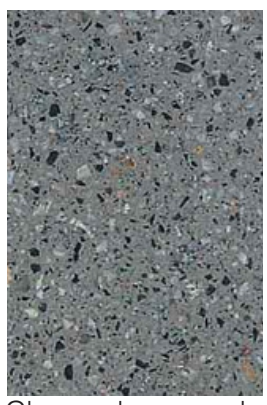
Charcoal exposed aggregate

For more concrete design ideas, visit: www.concretenetwork.com/indoor