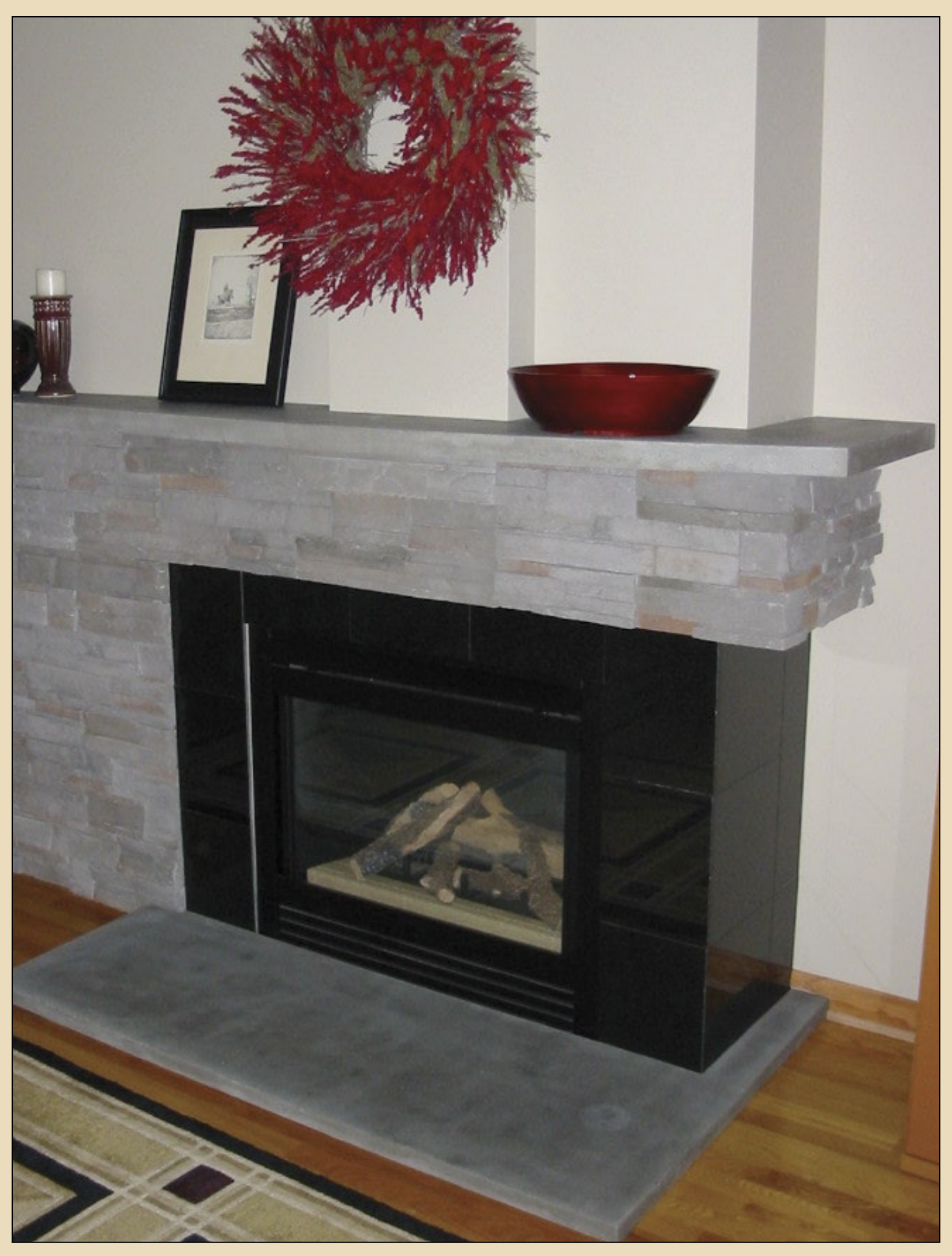
Find a Contractor in Your Local Area — \underline{\text{www.ConcreteNetwork.com}}