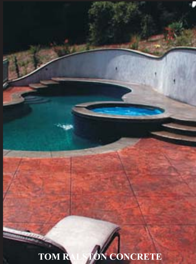
TOM RALSTON CONCRETE